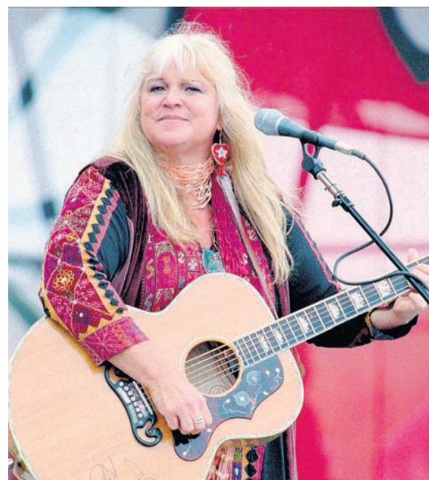
Melanie Safka opens the second day of the "A Day In The Garden" festival on Aug. 15, 1988, in Bethel, N.Y.

To go to those emotional places as Margaret "was harrowing at times," admits Kidman, who says she had to lose herself in the moment. "It's an exploration. ... It's like, put me in the place, put me in the scene, and let's go off to the objective and whatever comes through will come through." □